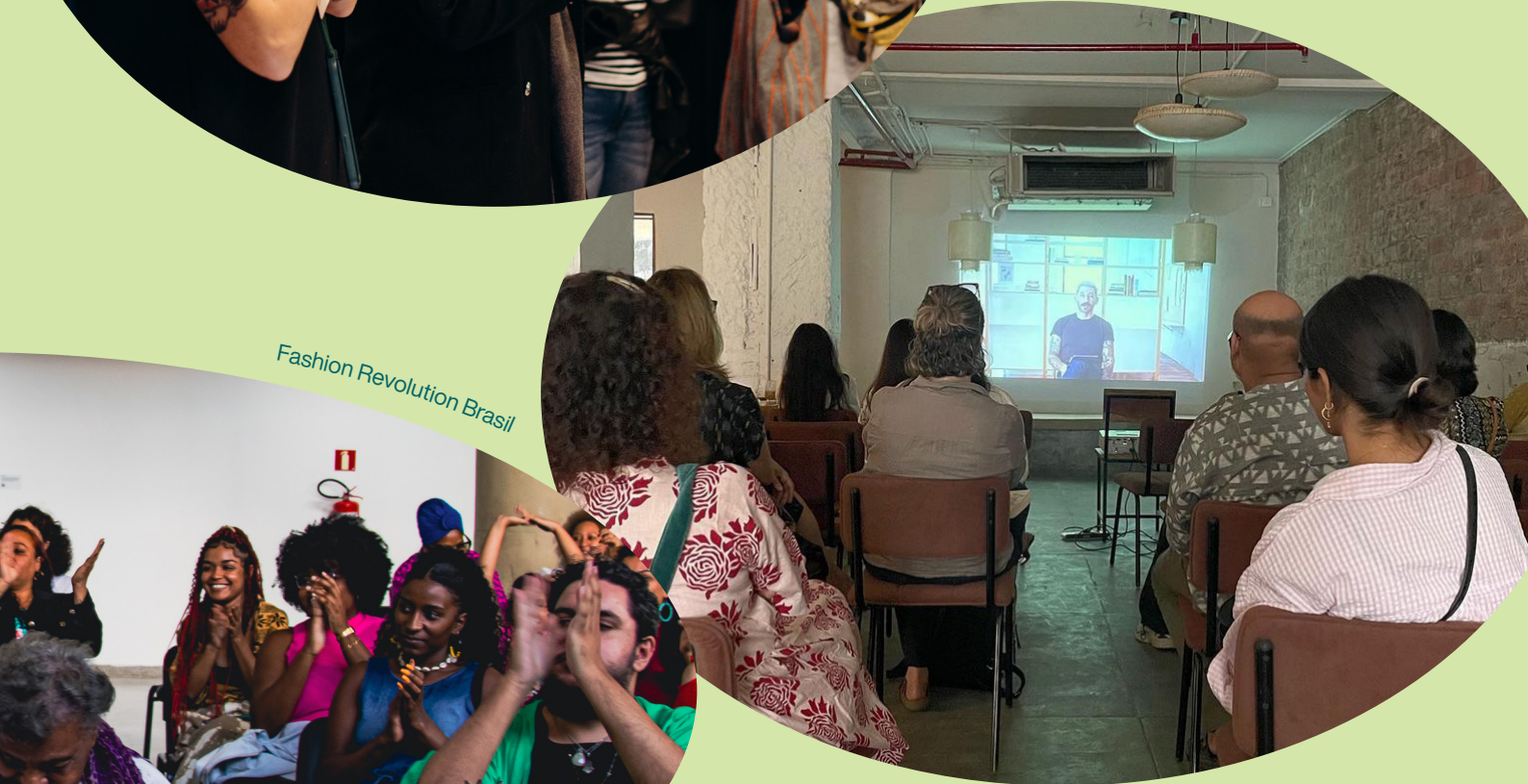
Fashion Revolution Brasil