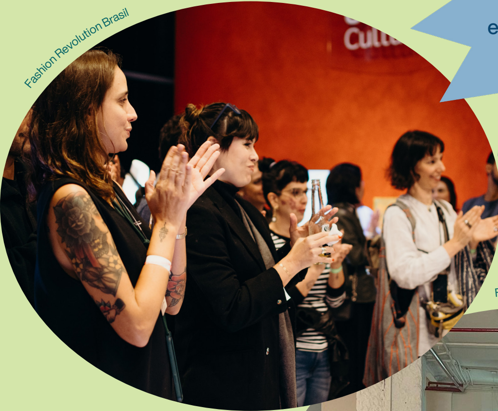
Fashion Revolution Brasil