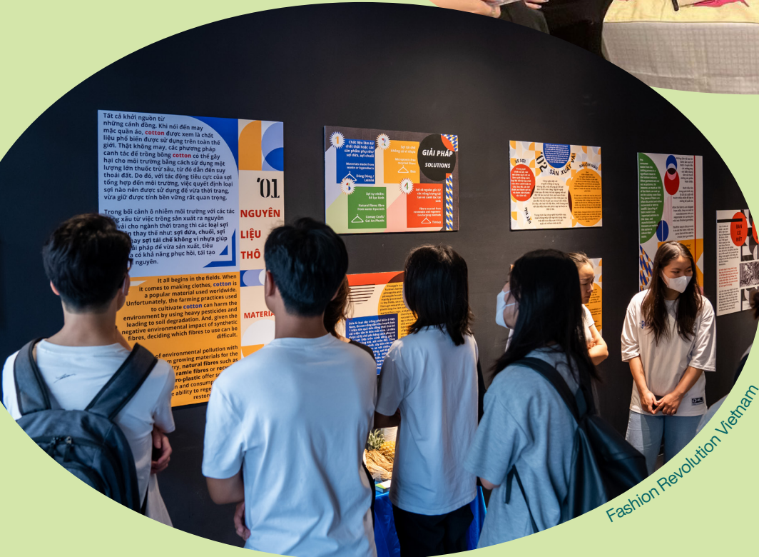
Fashion Revolution Vietnam