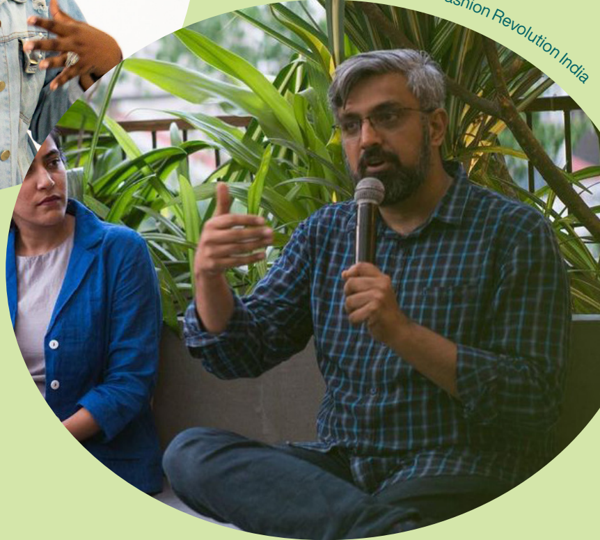
Fashion Revolution India