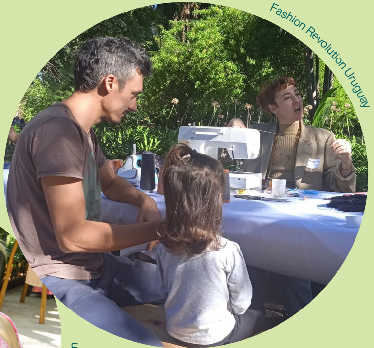
Fashion Revolution Uruguay