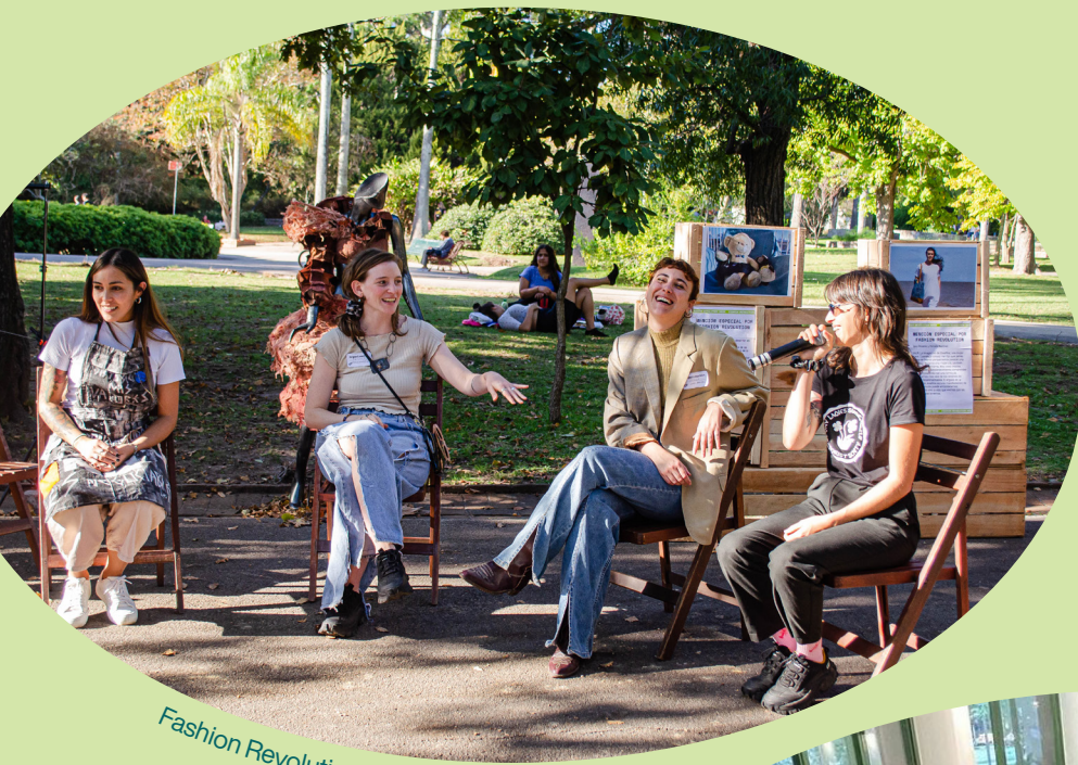
Fashion Revolution Uruguay