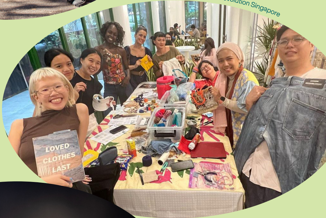
Fashion Revolution Singapore