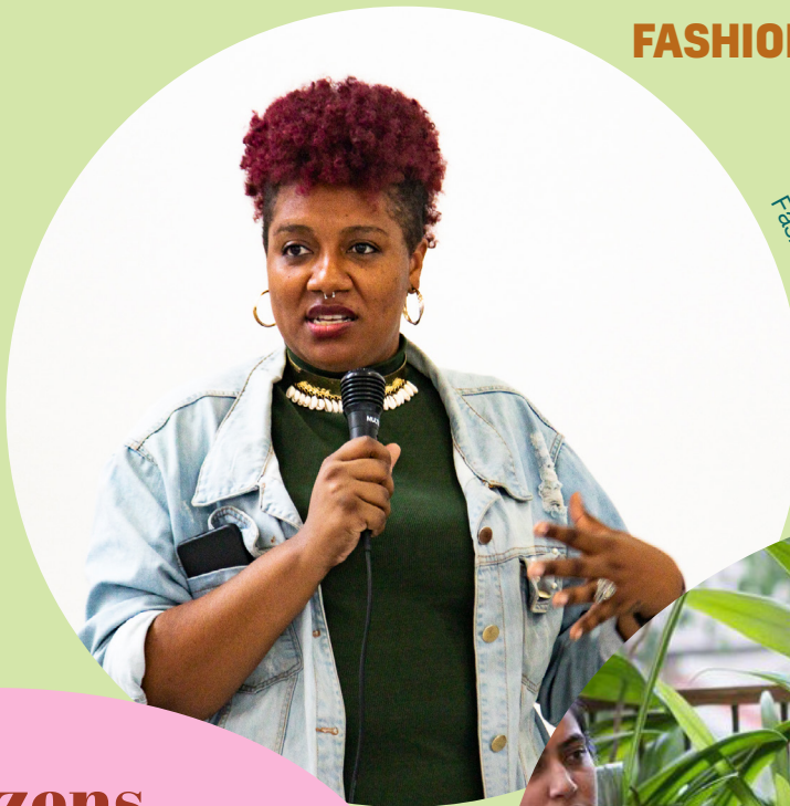
Fashion Revolution Brasil